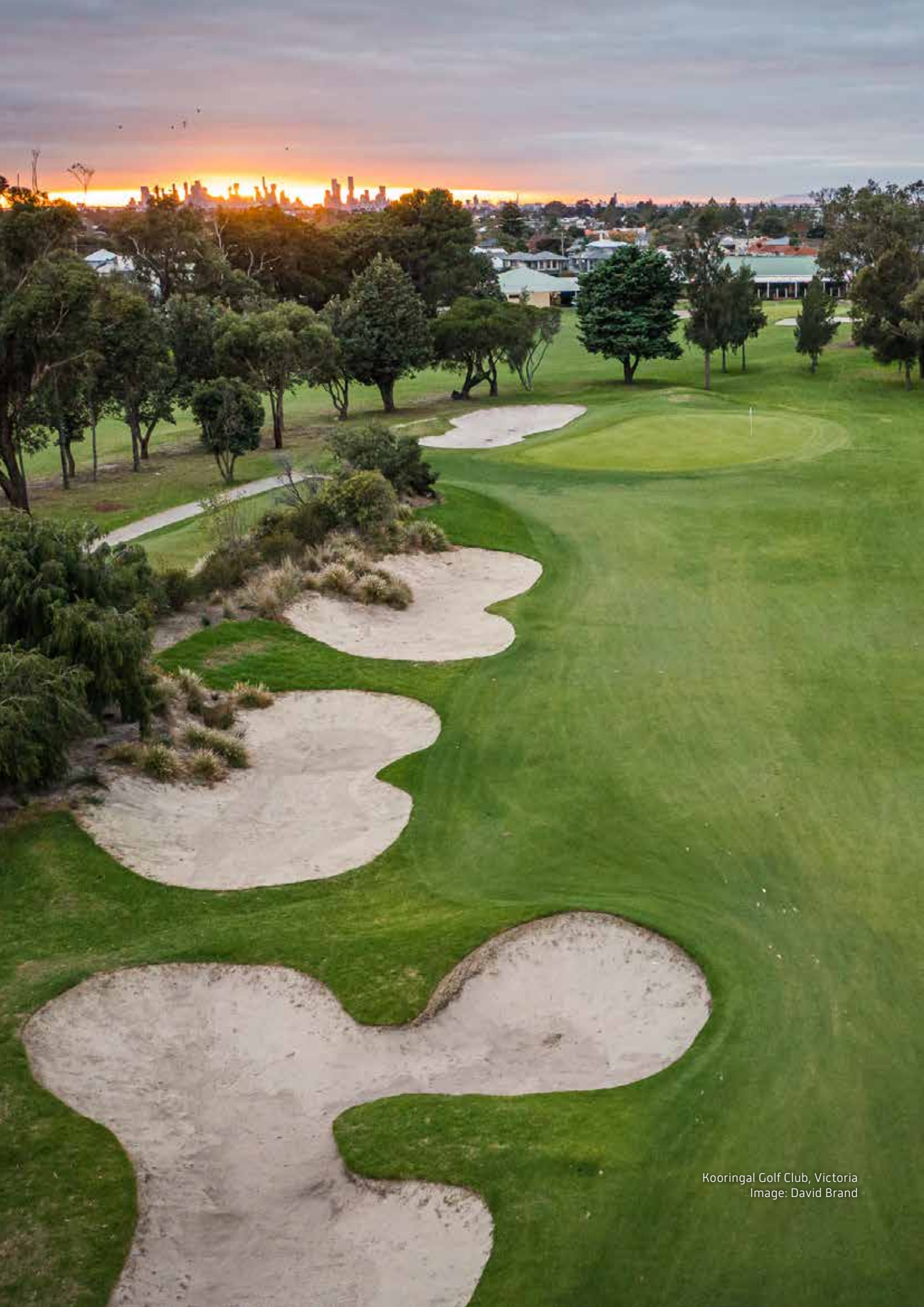
Koorringal Golf Club, Victoria