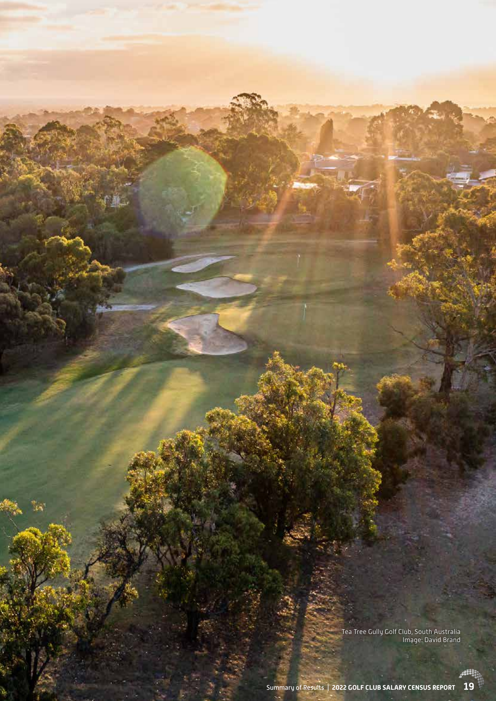
Tea Tree Gully Golf Club, South Australia