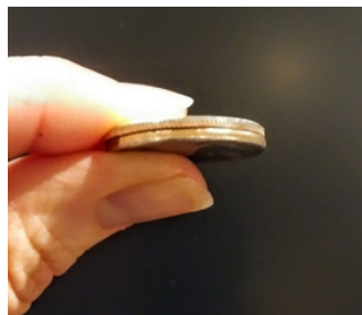
Greens cutting length