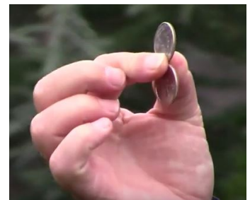
Home cutting length